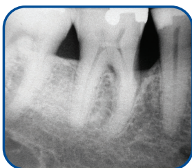
6 Years Post-LANAP® Protocol